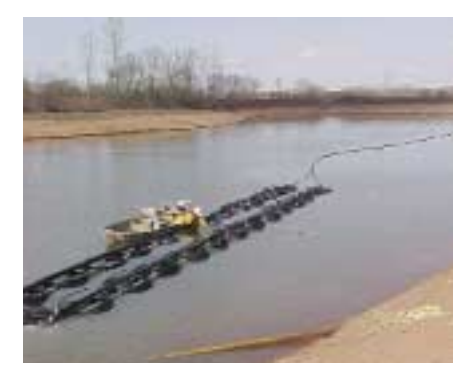
2. A heat exchanger being floated out to the middle of the pond. The unit will later be weighted and sunk.