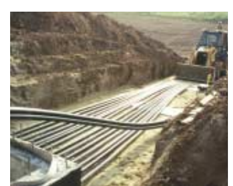
3. "Pigtail" pipes coming from the individual heat exchangers join at the valve pit (lower left).