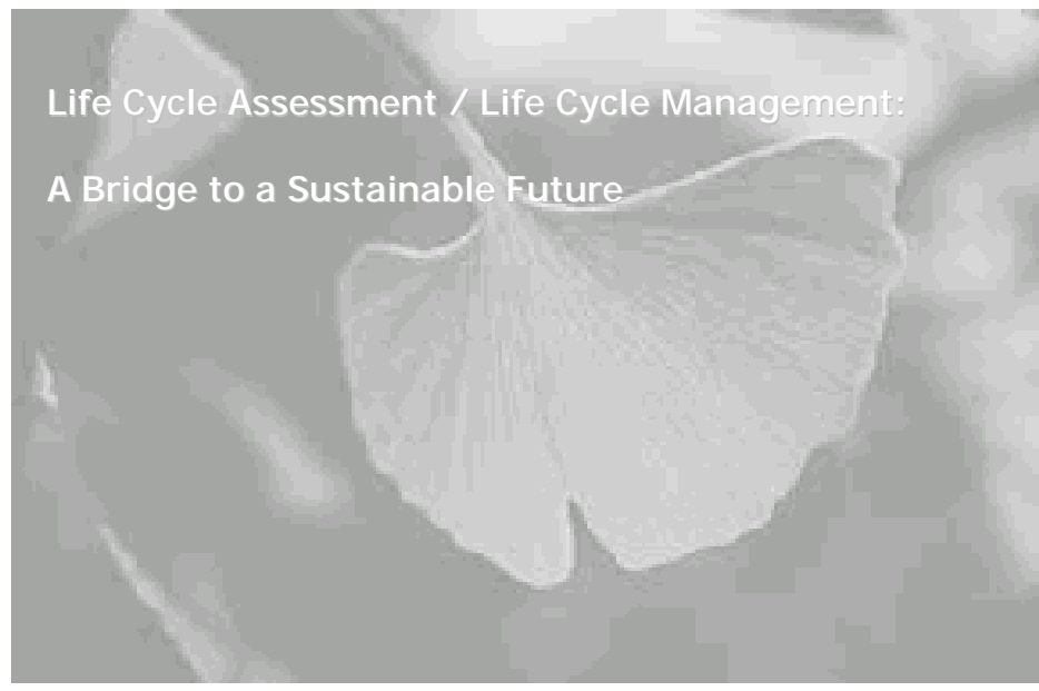
Seattle, Washington - September 22-25, 2003