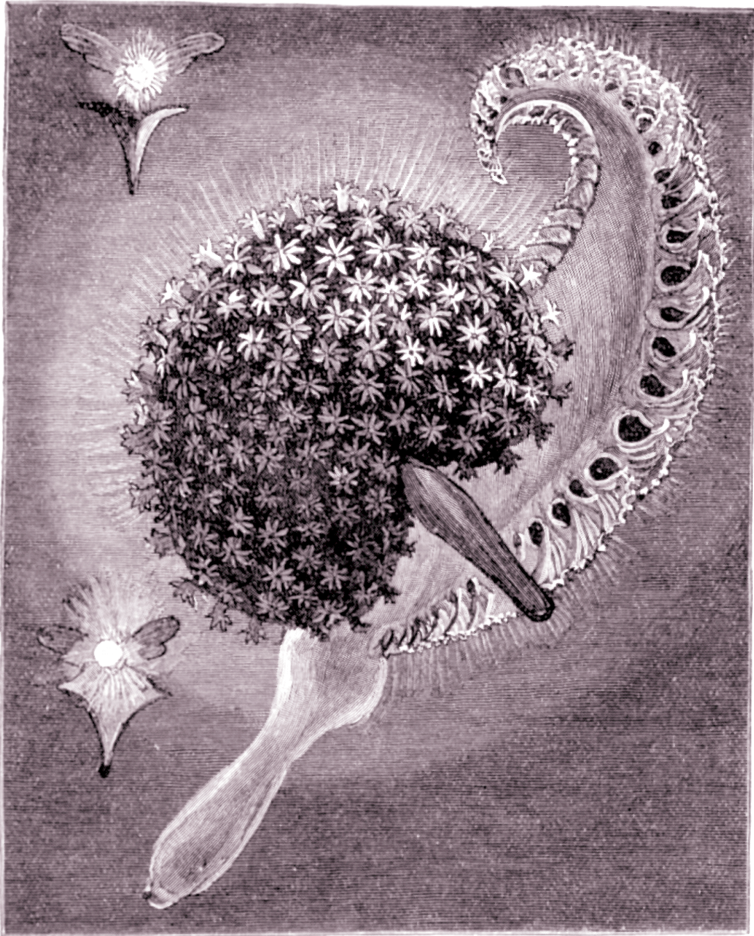
19th-century engraving of a phosphorescent sea creature.

reduces the value of the water for most human uses—whether for drinking, fishing, swimming, or even boating.