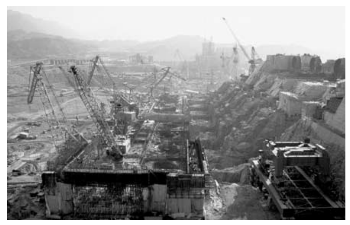
China's massive Three Gorges Dam, if completed, will be the largest hydroelectric dam in the world, providing 10 percent of the country's electricity. The project will, among other things, flood 1,300 known archeological sites, threaten numerous fish species, and force the relocation of nearly 2 million people. The project has been plagued by corruption and huge cost overruns.

ject and the Bank's role in it. In 1993, the Bank canceled its funding for the project.