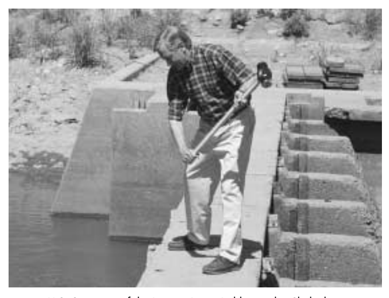
U.S. Secretary of the Interior Bruce Babbitt on his Sledgehammer tour "decommissions" the McPherrin Dam on Butte Creek in California. The McPherrin family was in attendance, and the dam was replaced with an irrigation pump. The following season, 20,000 Pacific salmon swam upstream.

The impact of dam building on communities has also been substantial. An estimated 40 to 80 million people have been physically displaced by the construction of dams. They have been flooded out, forced to move. One of the world's most massive engineering projects, the Three Gorges Dam in China, if completed could force the reloca-