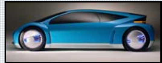
Toyota Fine S Concept