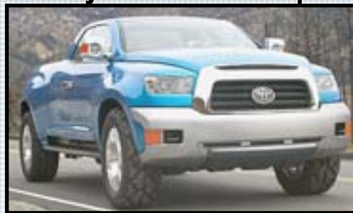
Toyota FTX Concept