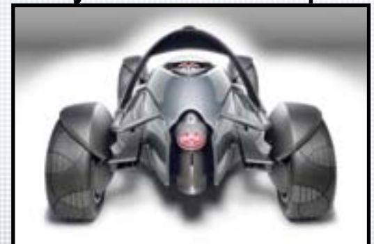
Toyota MTRC Concept