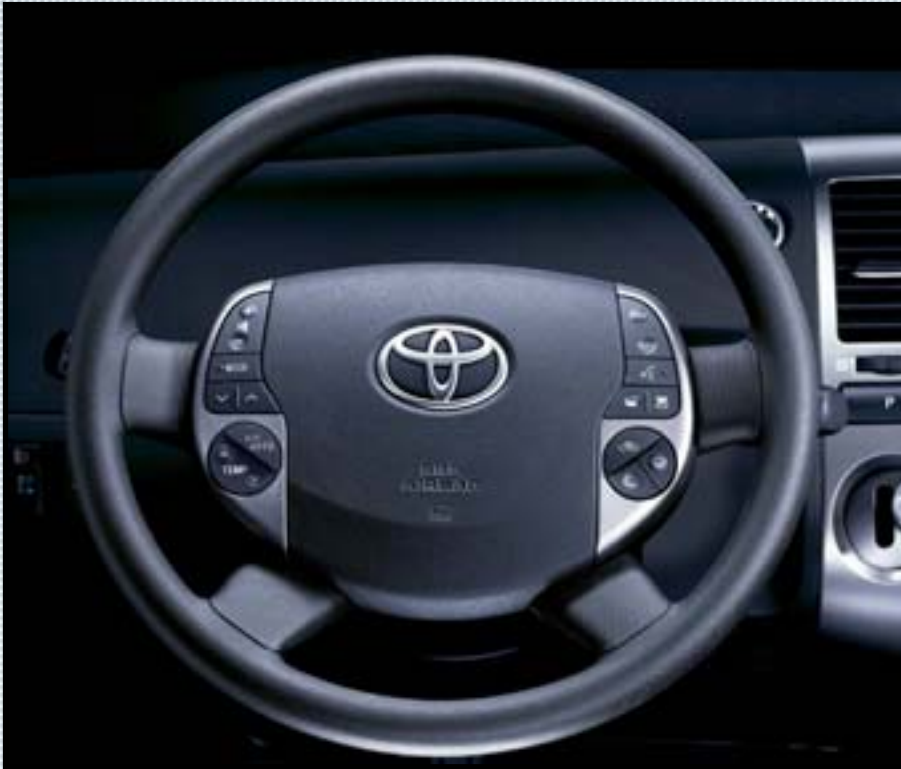
steering wheel controls