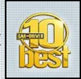
Car & Driver Magazine "10 Best List"