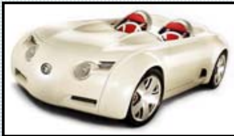
Toyota CS&S Concept