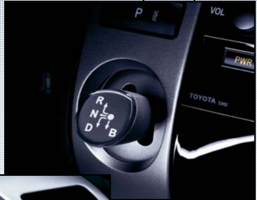
shift-by-wire gear shift