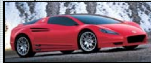
Toyota Volta Concept