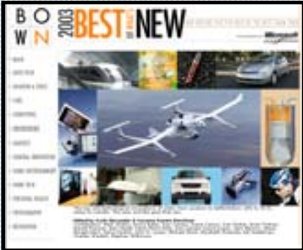
Popular Science Magazine "Best of What's New"