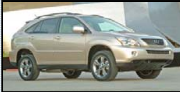
Lexus RX 400h