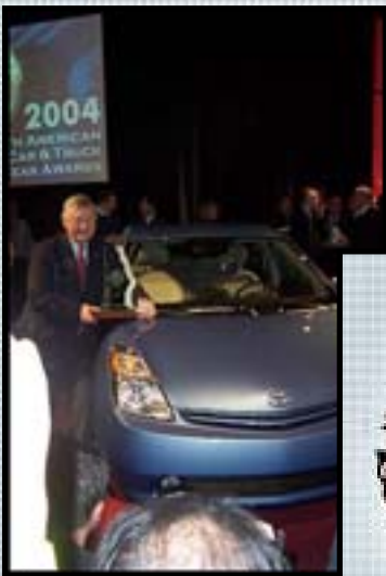
North American Car of the Year