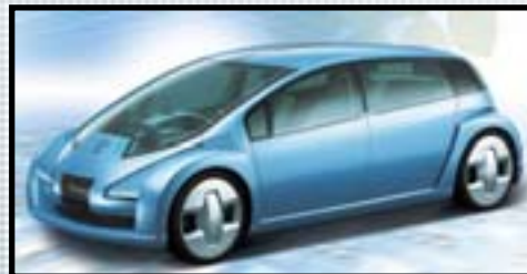
Toyota Fine N Concept