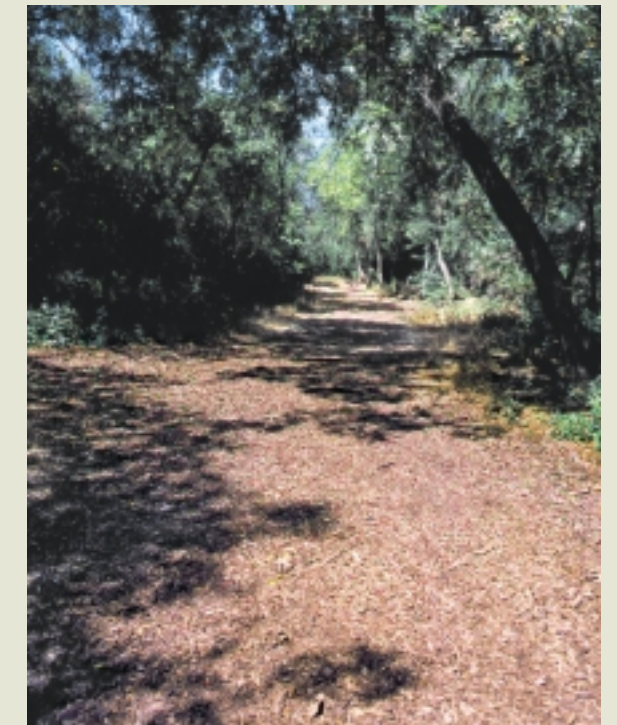
Open space in Fremont is enhanced with mulch made on-site using mixed greenwaste.