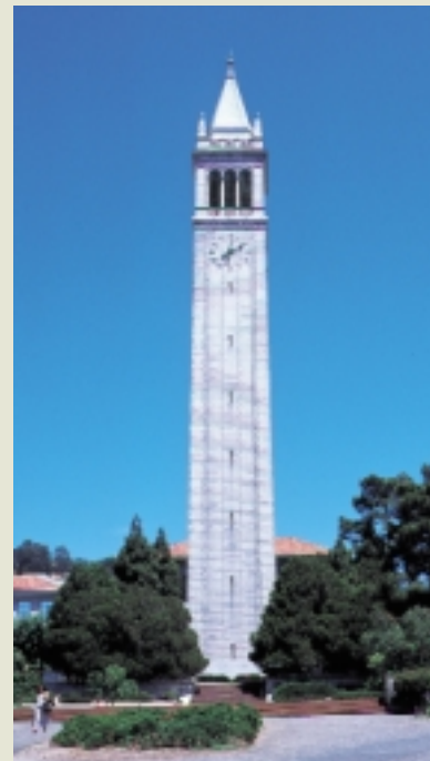
Campanile, UC Berkeley. Trees beneath the Campanile on the UC Berkeley Campus are mulched with mixed greenwaste.