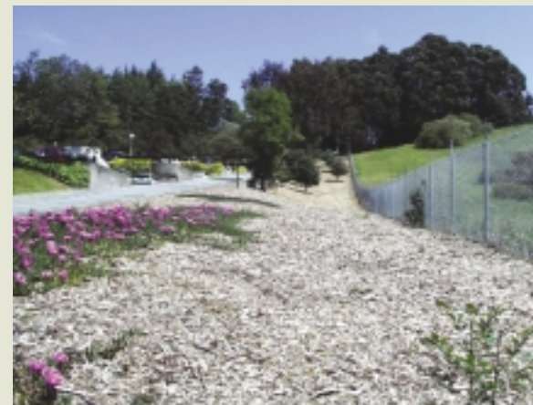
Mulch made on-site from trees infected with Pine Pitch Canker at EBRPD Headquarters, Oakland.