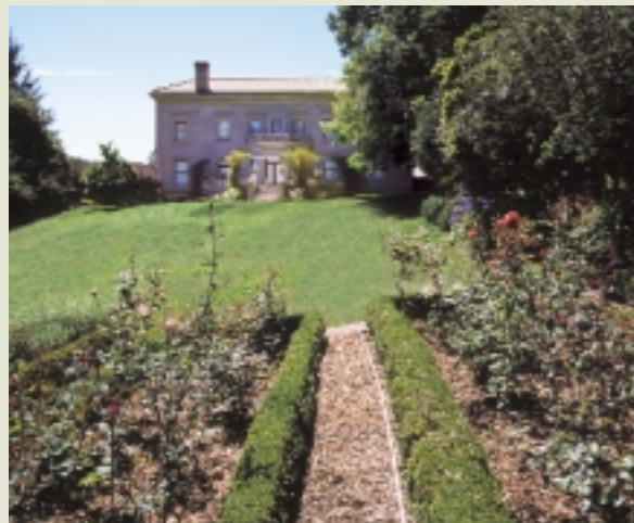
Locally produced wood chips are used in the beds and paths at the Chancellor’s home, UC Berkeley.