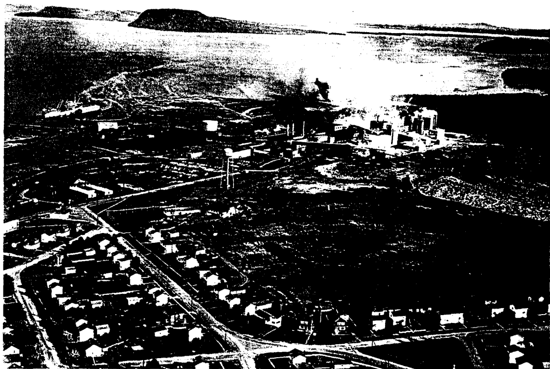
FIG. 2. Aerial photograph of the Domtar Red Rock mill, Nipigon Bay.

was tightened. Perhaps one of the most important modifications was the installation of an external treatment clarifier in 1973 for removal of fiber from wastewater. Following these studies, a condensate steam stripper was installed to eliminate volatile (primarily sulphurous) odorous and toxic materials.