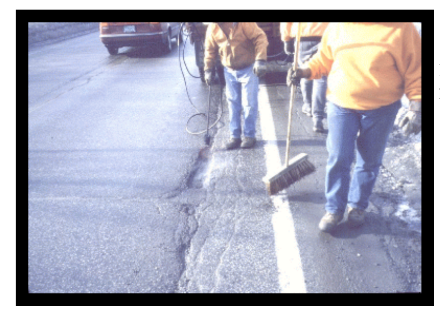
Drying potholes prior to cold patching. VT 14, South Barre