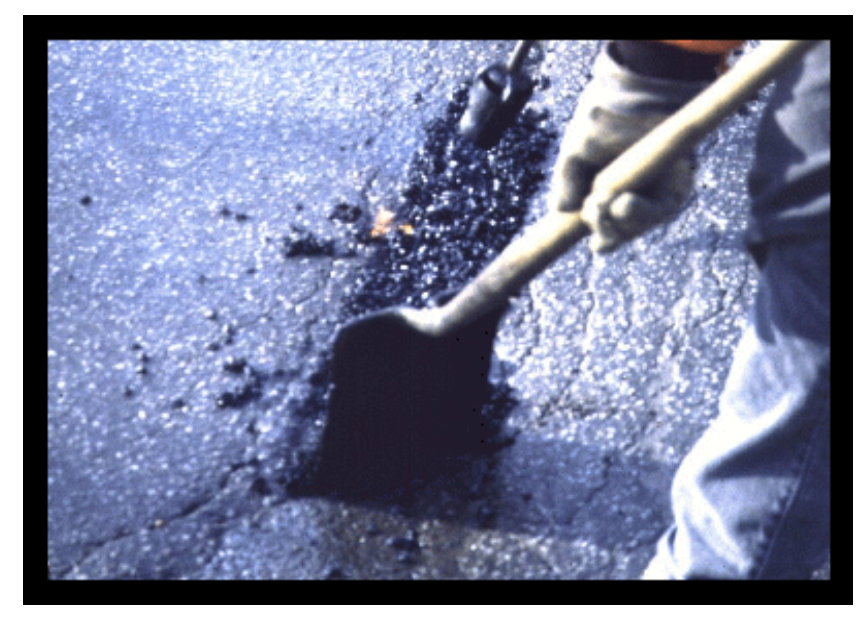
Pothole filling with cold patch, VT 14, South Barre.