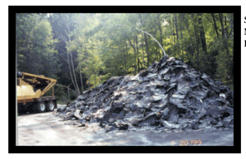
Stockpiled asphalt shingles at A. Marcelino and Company, South Burlington.

Chittenden Solid Waste District's grinder processing some of the 394 tons of waste asphalt shingles collected from April 1999 to July 2000.