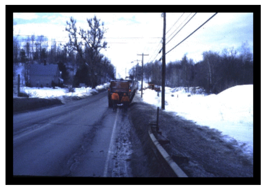
VTrans trial location for RAS cold patch, VT 14, South Barre, VT