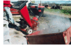
Figure 2. Onsite grinding of drywall

At new home construction sites ground gypsum drywall can be applied to the land surrounding the building site. Waste gypsum board needs to be pulverized in order to allow the drywall’s absorption into the soil. Pieces smaller than ½ inch sq. can generally be applied to the soil. The shredded gypsum drywall should be spread evenly over the soil and must be applied in areas with adequate drainage and aeration, so that no anaerobic reaction occurs. 63 Onsite application requires a mobile processing machine, as well as a mechanism to spread the shredded drywall.