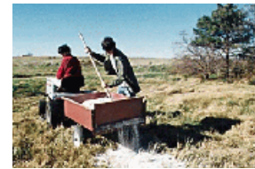
Figure 3. Spreading ground drywall.