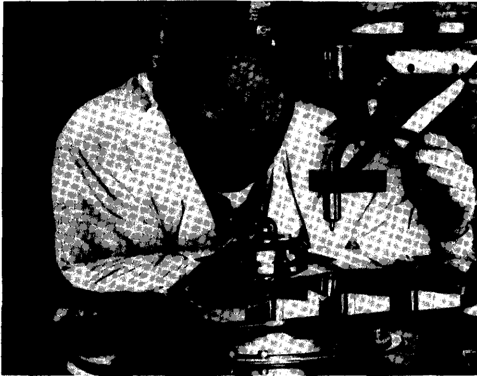
Figure 2. The infrared Keck secondary being measured on LODTM.