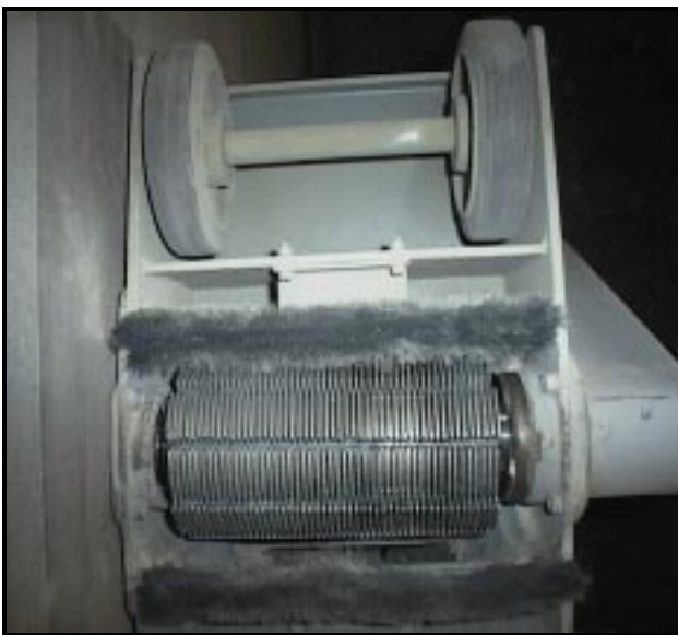
Figure 1. Shaver and the shaving drum.

The concrete shaver used for this demonstration is shown in Figure 1. Figure 2 shows the concrete shaver in use during the technology demonstration at the Hanford Site C Reactor building in Sample Room X.