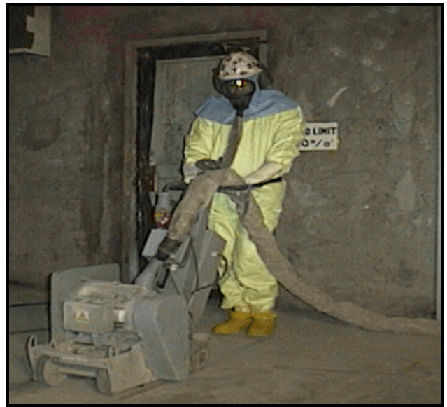
Figure 2. Decontamination in Sample Room X.