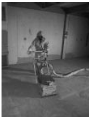
Figure 3. Baseline 5-piston scabbler.

A moisture separator and pressure regulator are mounted directly on unit frame, and the unit also contains an automatic in-line oiler for low piston maintenance. The entire unit is mounted on a sturdy wheeled hand-cart assembly for ease of movement. Figure 3 shows the baseline unit as it was used. Three types of scabbler bits are available to meet the desired surface preparation, with each scabbler bit designed for 50 hours of operation. Figure 4 shows one of the 5 piston heads used in the baseline demonstration, with the type of bits employed.