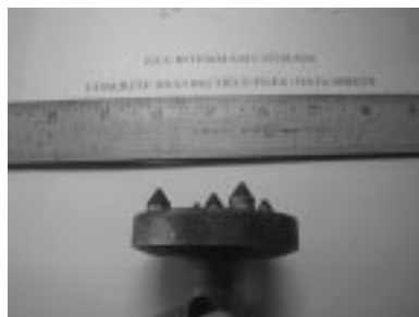
Figure 4. Piston head with bits for scabbler.