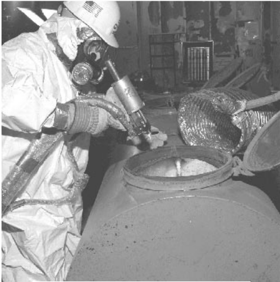
Figure 2. The mixing gun combines the chemicals and injects the liquid foam into the vessel.