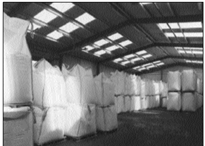
STPP (sodium tri poly phosphate) ready for detergent production.

Which (1999), ' On test: Laundry detergents ', September 1999.