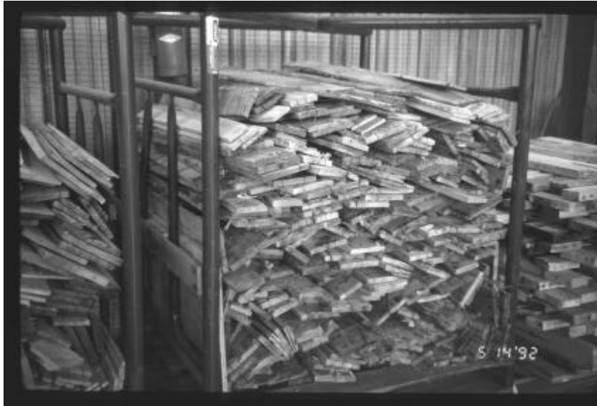
Figure 2. Recovered pallet parts ready for reuse to repair broken pallets.