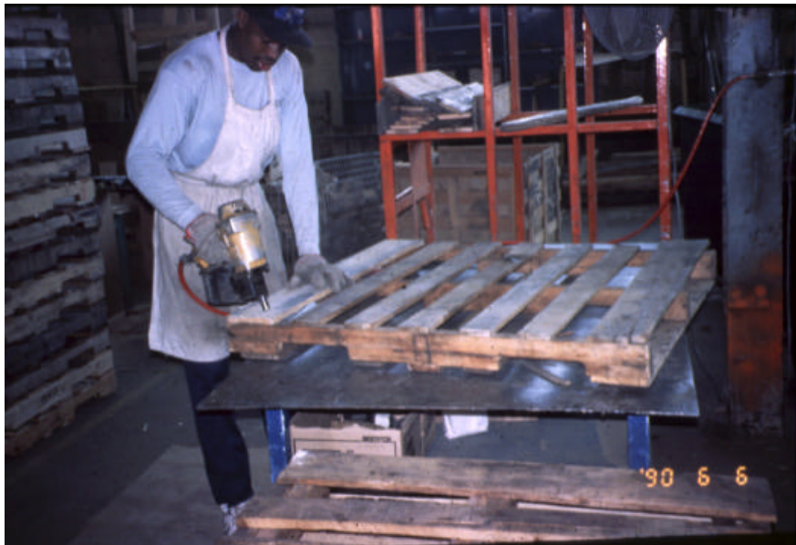
Figure 3. A replacement part being used to repair a pallet.