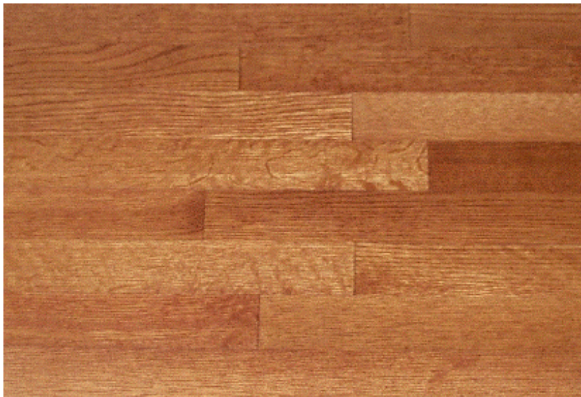
Figure 5. Red oak flooring made from used pallet parts.