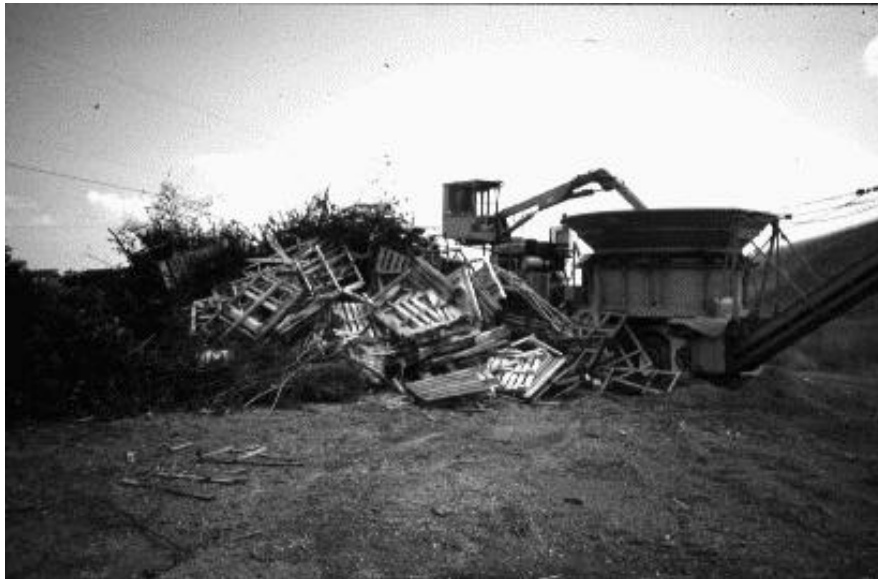
Figure 6. Current recovery method of grinding pallets with tub grinders to usable fiber as used at landfill recovery areas.

c Value based on number of parts useable for flooring and the yield in flooring blanks from the parts and the remaining parts that can be sold as replacement parts.