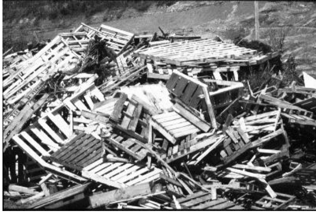
Figure 1. A typical variety of wood pallets at a landfill recovery area.

Many wood pallets end up in landfills. The combined landfill totals (Construction and Demolition and Municipal Solid Waste) show that over 223 million pallets (6.14 million tons) passed through landfill gates in 1995 (Araman, Bush and Reddy 1997; Bush and Araman 1997c). Approximately 17 percent (38 million pallets or 1.04 million tons) were recovered, mainly to little or no revenue products. Landfill operators would welcome markets for pallets that would return more money to their facilities or companies that would recover the pallets sent to landfills. Many landfills have grinders and more would likely add grinders if they could be assured of an economical market for ground pallet material. They would also be interested in adding other equipment to increase revenues. Our business plan spreadsheet models were developed to evaluate different recovery options at landfills or at independent sites.